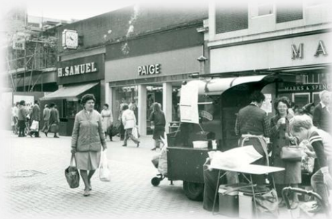
Dudley marketplace pictured in the early 1980's. You can see PIAGÉ and H.Samuel . The trueform shoe shop is also being rebuilt