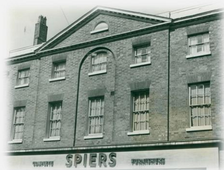
The Spiers home furnishing store in Dudley High Street in April 1970.

The Hen and Chickens Hotel in 1982. Locals would pop into The Hen and Chickens Hotel for a quick pint and a chat in December 1982. The popular watering hole dominated the corner of New Street and Castle Street in Dudley